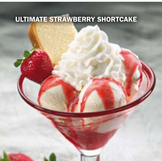
ULTIMATE STRAWBERRY SHORTCAKE