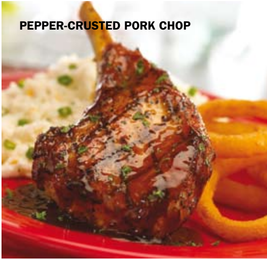
PEPPER-CRUSTED PORK CHOP

A delightful mixture of scrambled eggs, onions, peppers, Pepper Jack, and Cheddar cheeses all rolled in a large flour tortilla and grilled. Served with Friday's® breakfast potatoes, salsa, sour cream, and guacamole. 8.99