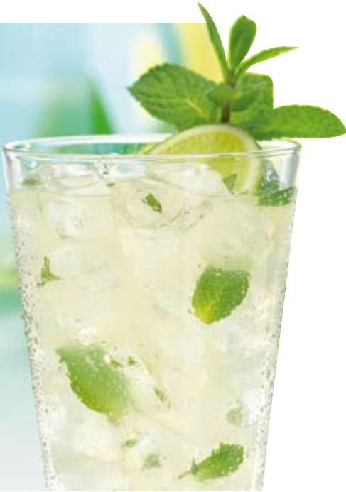
TOP SHELF MOJITO

SIP WITH STATUS BY UPGRADING TO A PREMIUM LIQUOR.