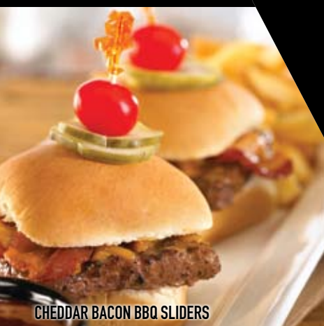
CHEDDAR BACON BBQ SLIDERS