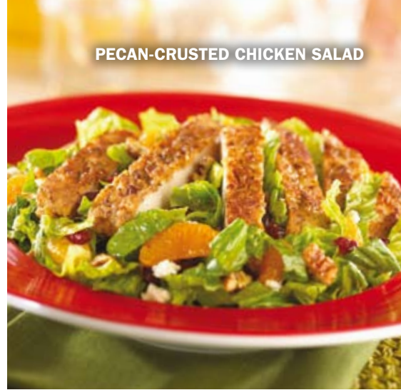
PECAN-CRUSTED CHICKEN SALAD

SALAD DRESSINGS: Low Fat Cilantro Lime, Balsamic Vinaigrette, Bleu Cheese, Honey Mustard, Italian, Ranch