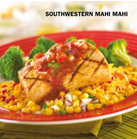
SOUTHWESTERN MAHI MAHI

GIVE ME MORE EXTRAS: Add a House Salad, Caesar Salad or Cup of Soup for 2.99.