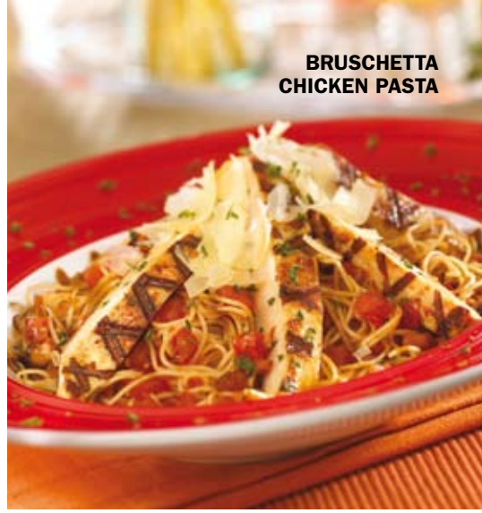
BRUSCHETTA CHICKEN PASTA

GIVE ME MORE EXTRAS: Add a House Salad, Caesar Salad or Cup of Soup for 2.99.