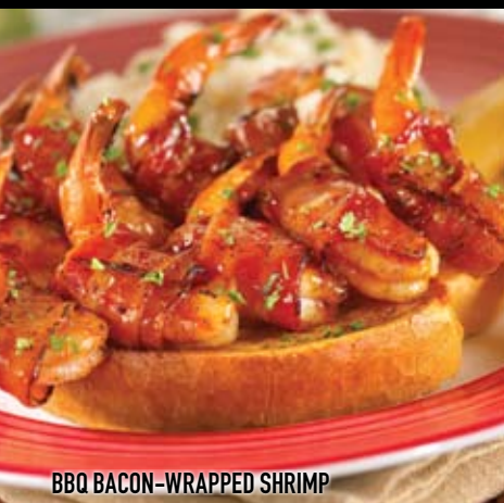
BBQ BACON-WRAPPED SHRIMP