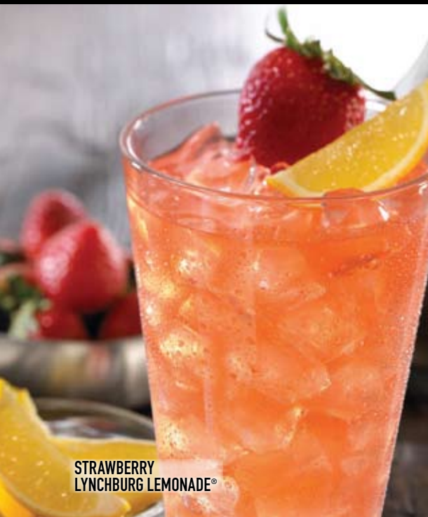
STRAWBERRY LYNCHBURG LEMONADE®

Our latest twist on the famous citrus classic is shaken with fresh strawberries and Jack Daniel's®.