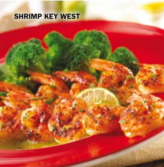
SHRIMP KEY WEST