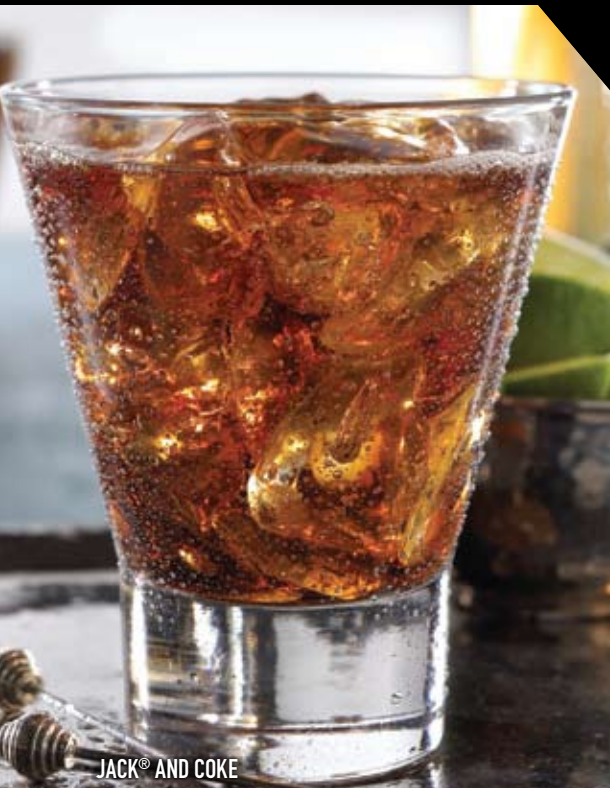
JACK® AND COKE

ENJOY JACK™ CHAMPIONSHIP BBQ WITH ONE OF THESE COOL JACK DANIEL'S® SOUTHERN SIPPERS.