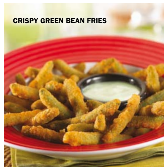
CRISPY GREEN BEAN FRIES

Three mouthwatering mini burgers made with all-beef patties served with lettuce, tomatoes, pickles and onions. Topped with American cheese and caramelized onions. 8.99