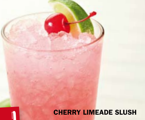
CHERRY LIMEADE SLUSH