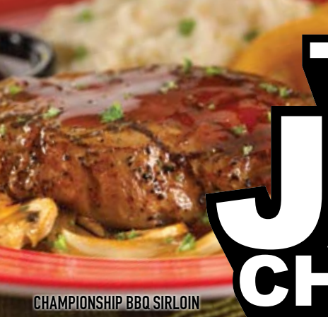
CHAMPIONSHIP BBQ SIRLOIN