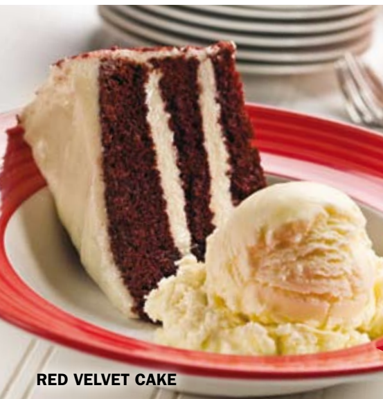
RED VELVET CAKE

Indulge yourself in moist, chocolaty red velvet cake layered with cream cheese frosting and paired with Vanilla Ice Cream. 5.49