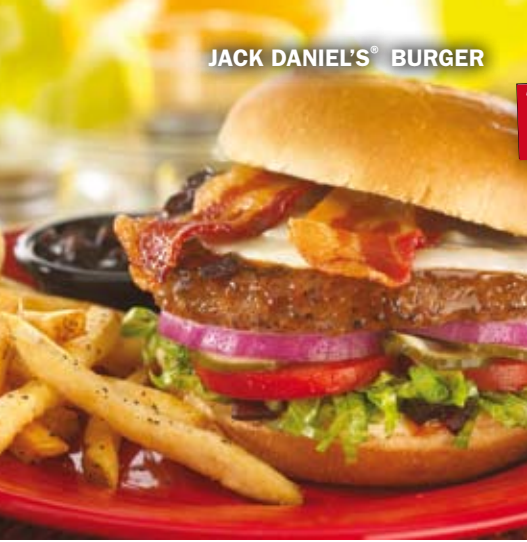
JACK DANIEL'S® BURGER