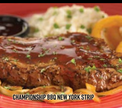
CHAMPIONSHIP BBQ NEW YORK STRIP

THIS AIN'T YOUR MAMA'S SAUCE. IT'S FROM THE WINNER OF THE JACK TM , THE GRAND-DADDY OF BBQ SHOWDOWNS. AND IT'S ONLY AVAILABLE AT FRIDAY'S®