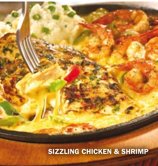
SIZZLING CHICKEN & SHRIMP